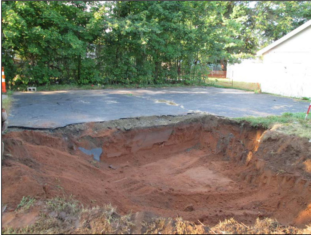
View looking south at extent of excavation in parking area.