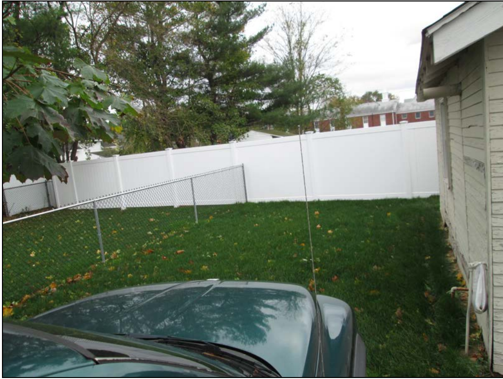
View looking west at restored back yard.