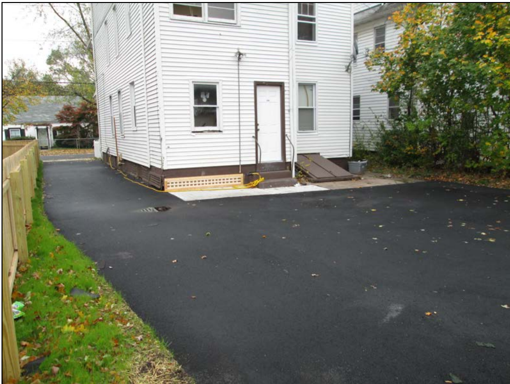
View looking east at restored parking area.