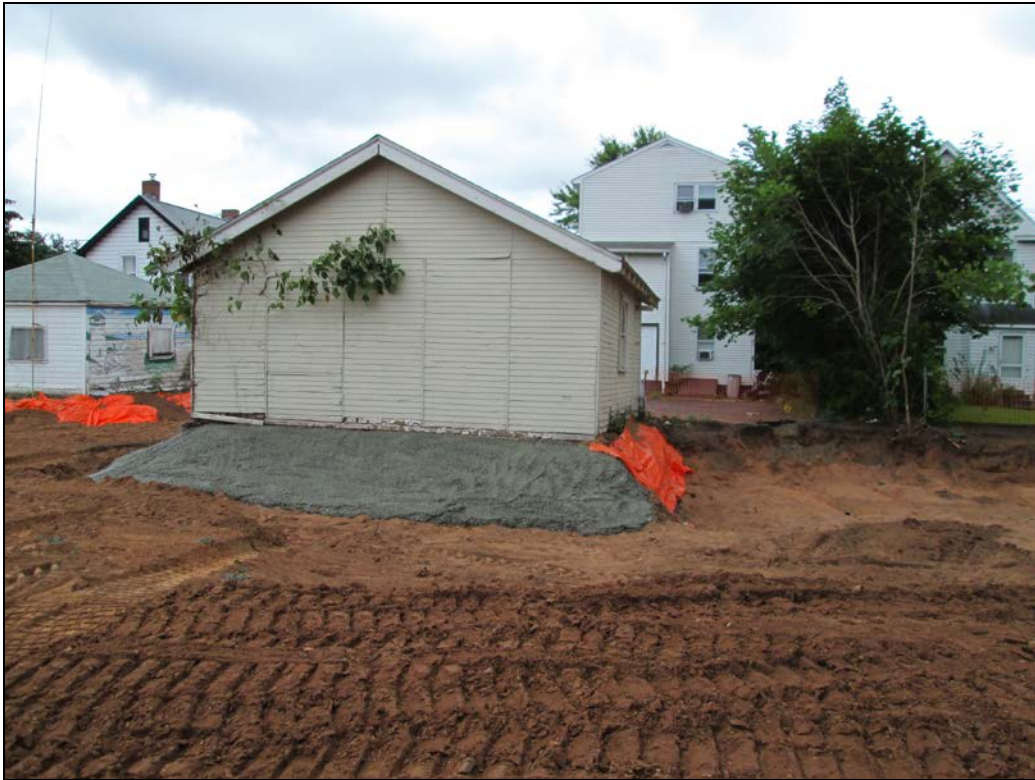
View looking east at excavated back yard during placement of marker barrier around garage.