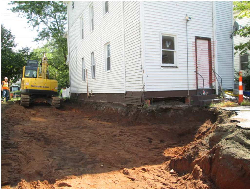
View looking east at excavated driveway area.