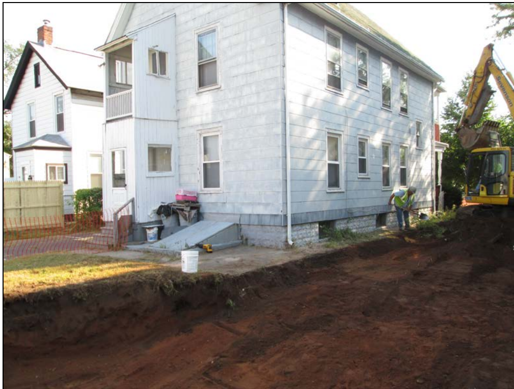
View looking northeast at excavated driveway area.