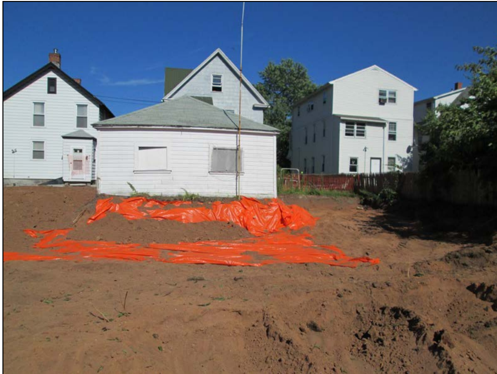
View looking east at excavated back yard following placement of marker barrier.