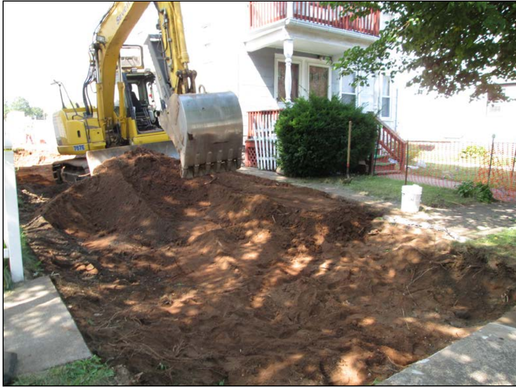
View looking northwest at excavated front yard.