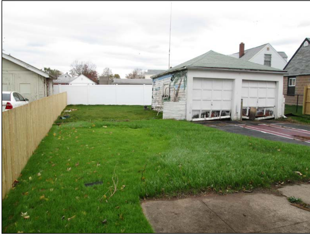
View looking west at restored back yard.