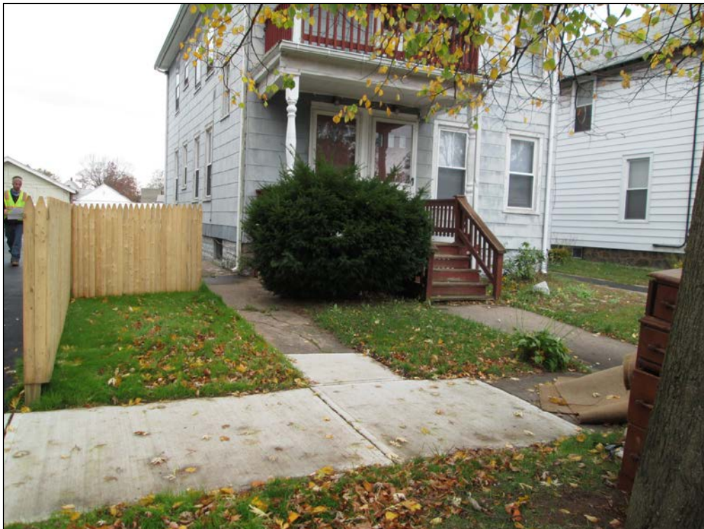
View looking west at restored front yard.