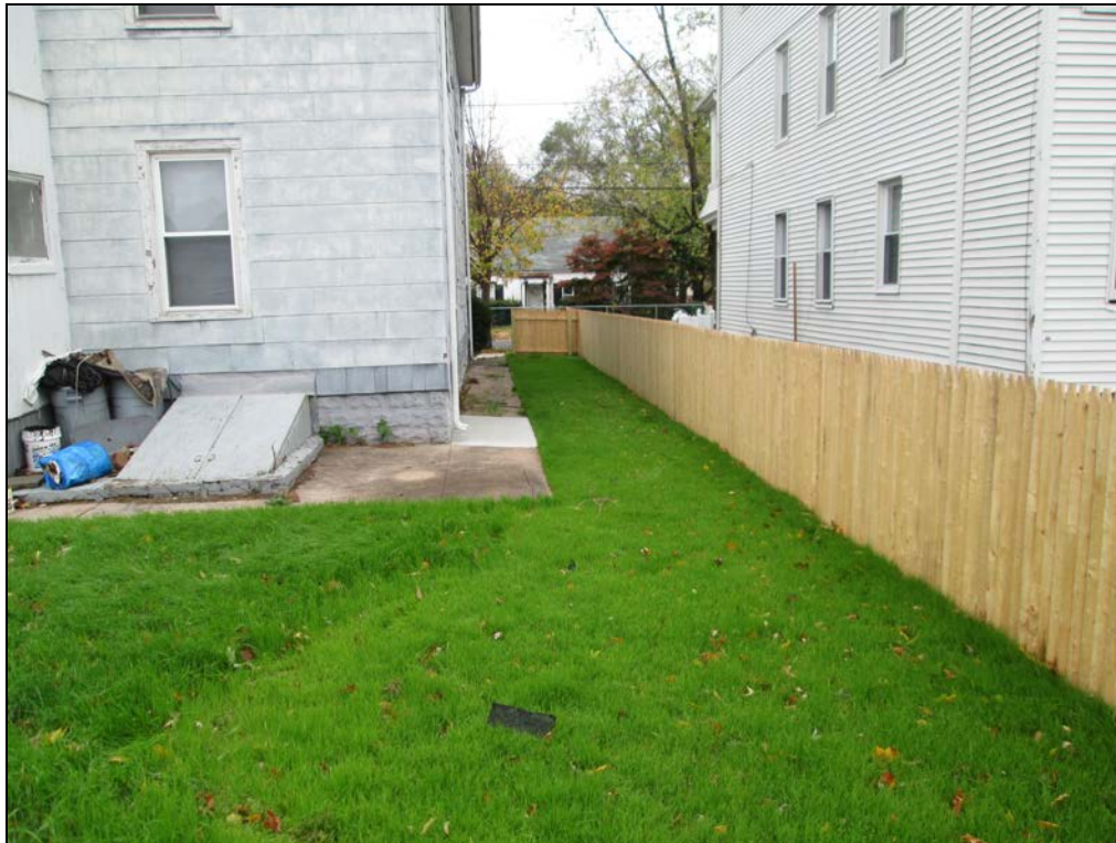
View looking east at restored back yard.