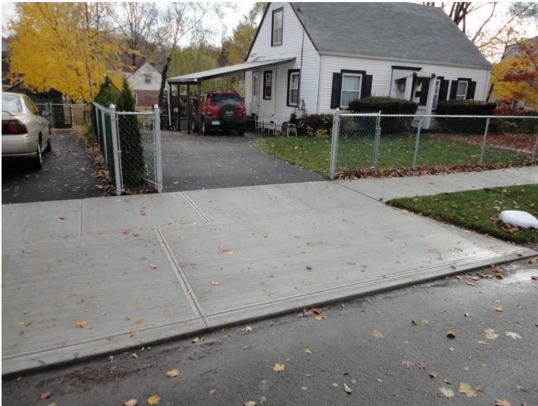
View looking southeast from Winchester Avenue at fully restored property.