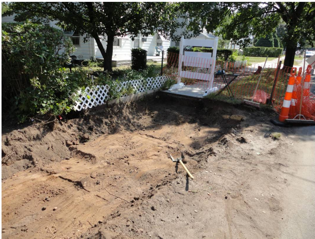
View looking south from Winchester Avenue at extent of excavation in sidewalk in front of 973 Winchester Avenue.