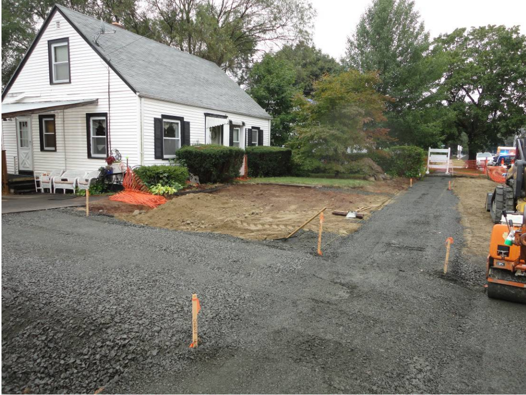
View looking south at property prepped for installation of new driveway, sod, and fencing.