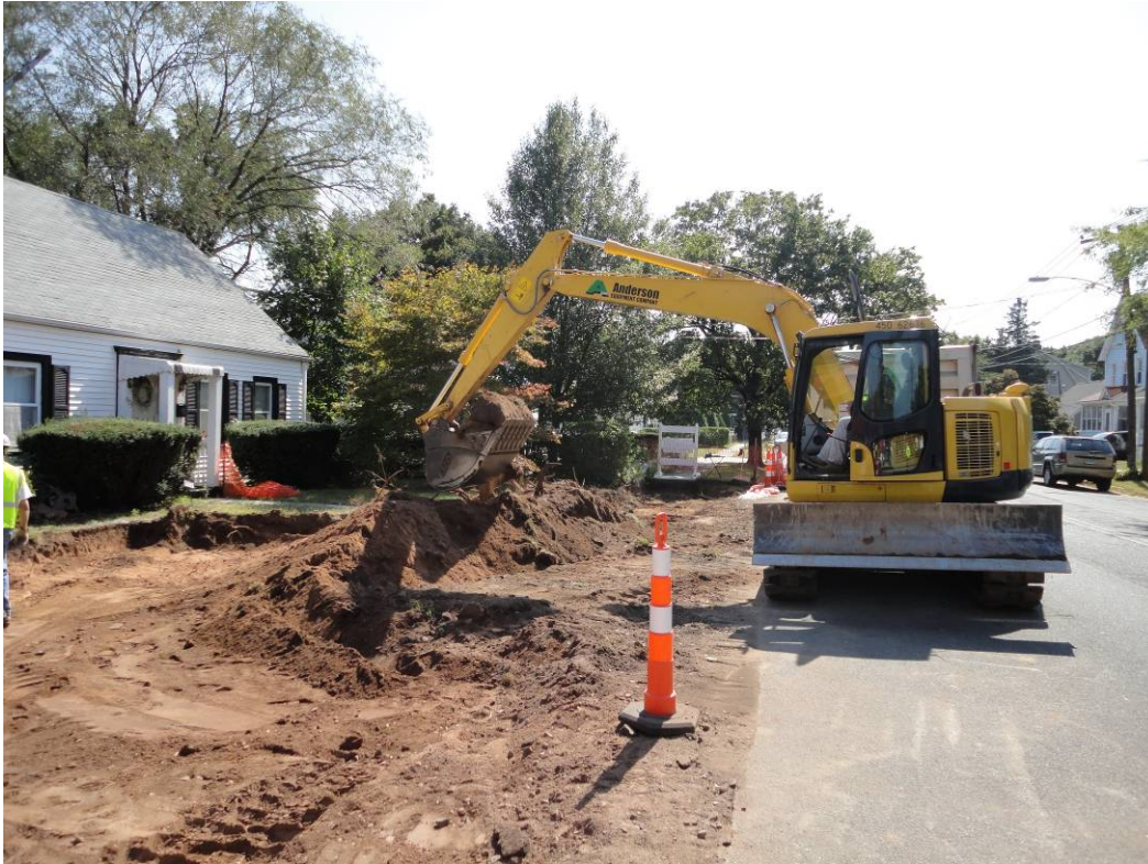
View looking south from Winchester Avenue at excavation in front yard of 973 Winchester Avenue.