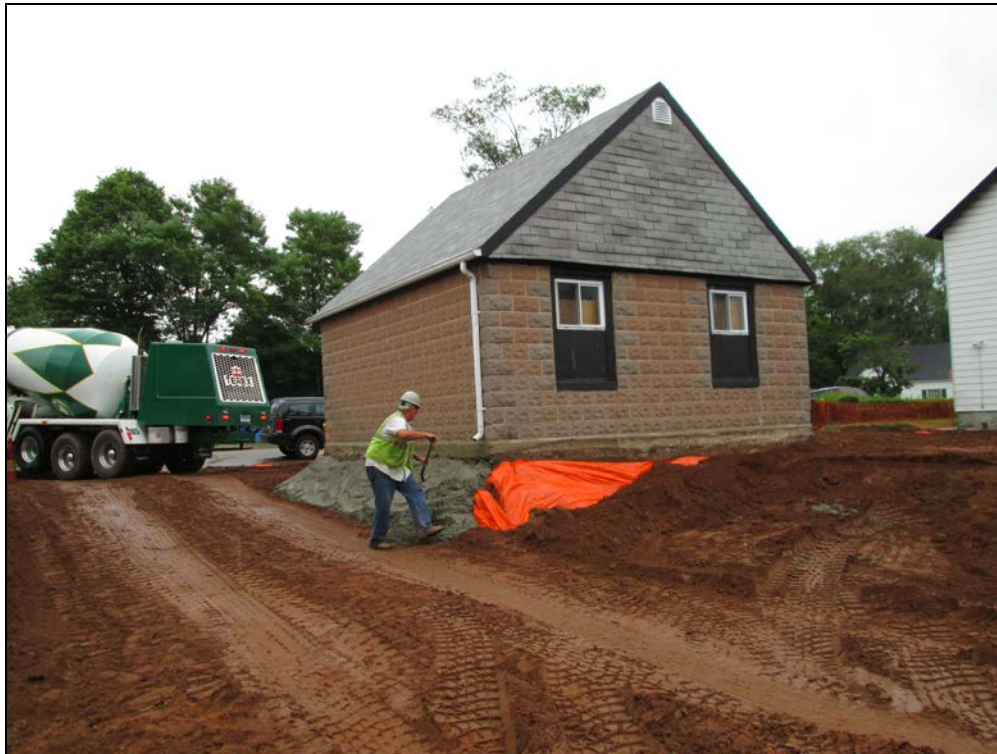
View looking northeast at partially backfilled garage area.