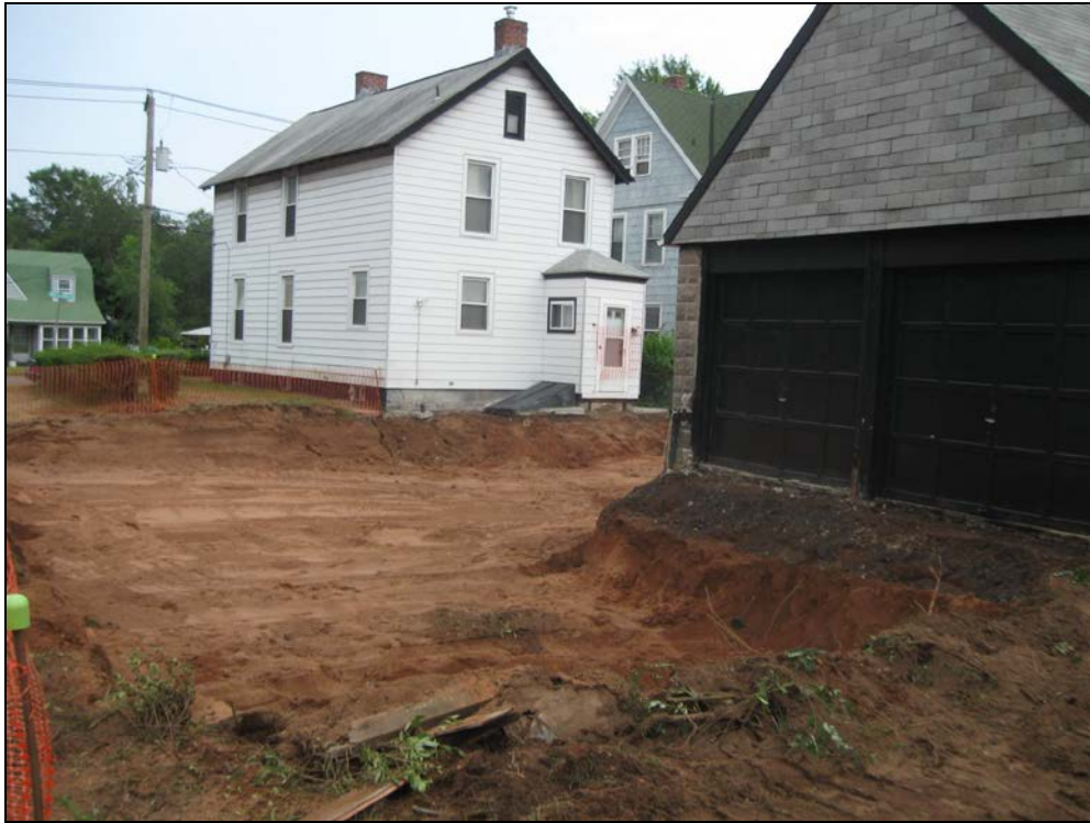
View looking east at excavated driveway and backyard.