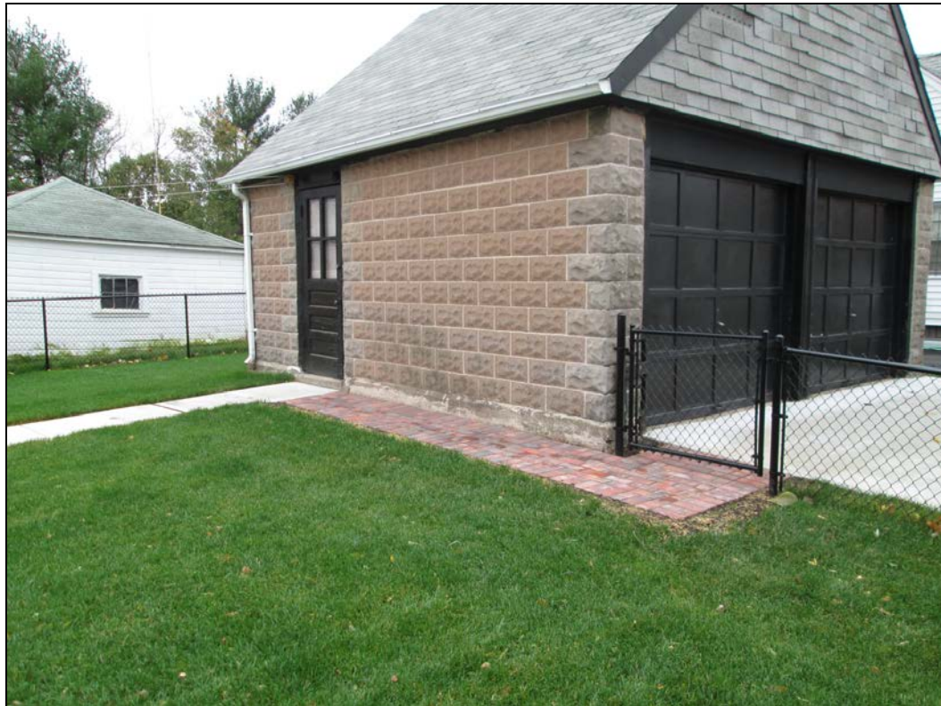
View looking southwest at restored garage area.