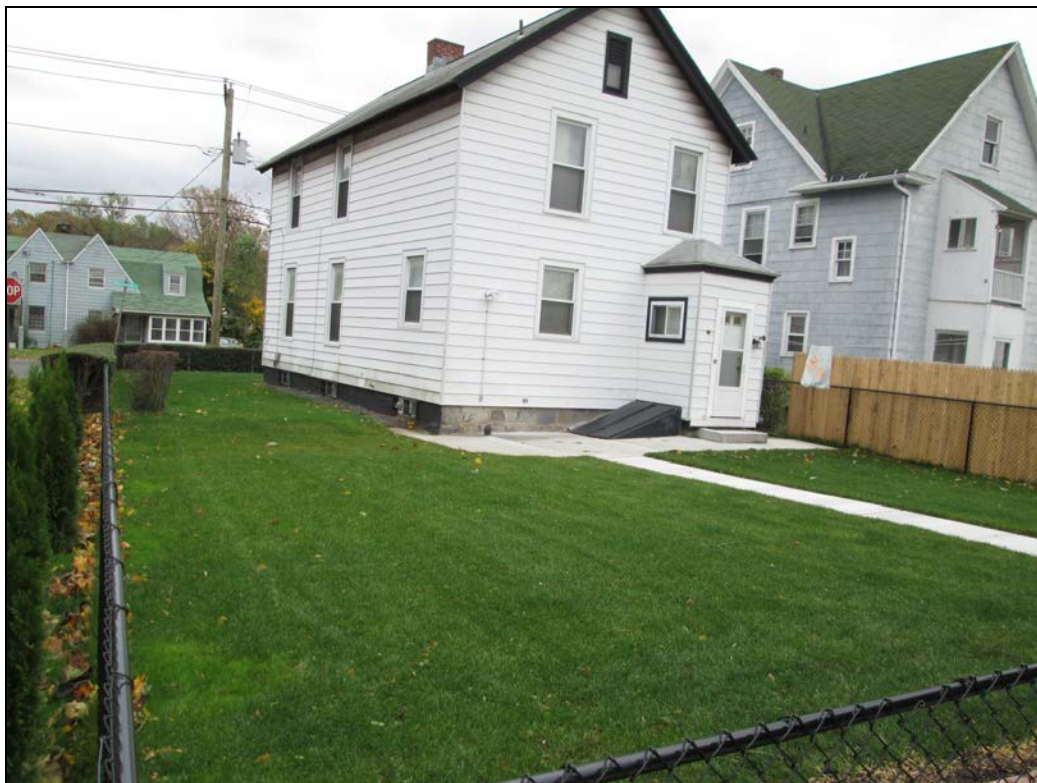
View looking east at restored back yard.