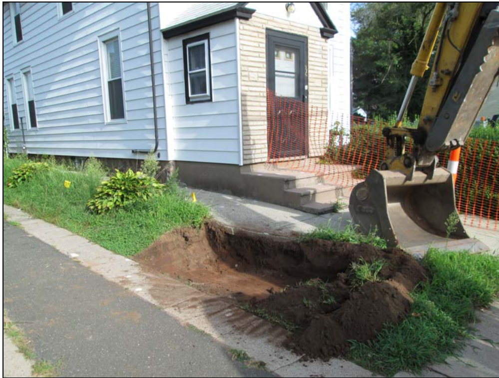
View looking northwest at excavation of isolated fill area in front yard.