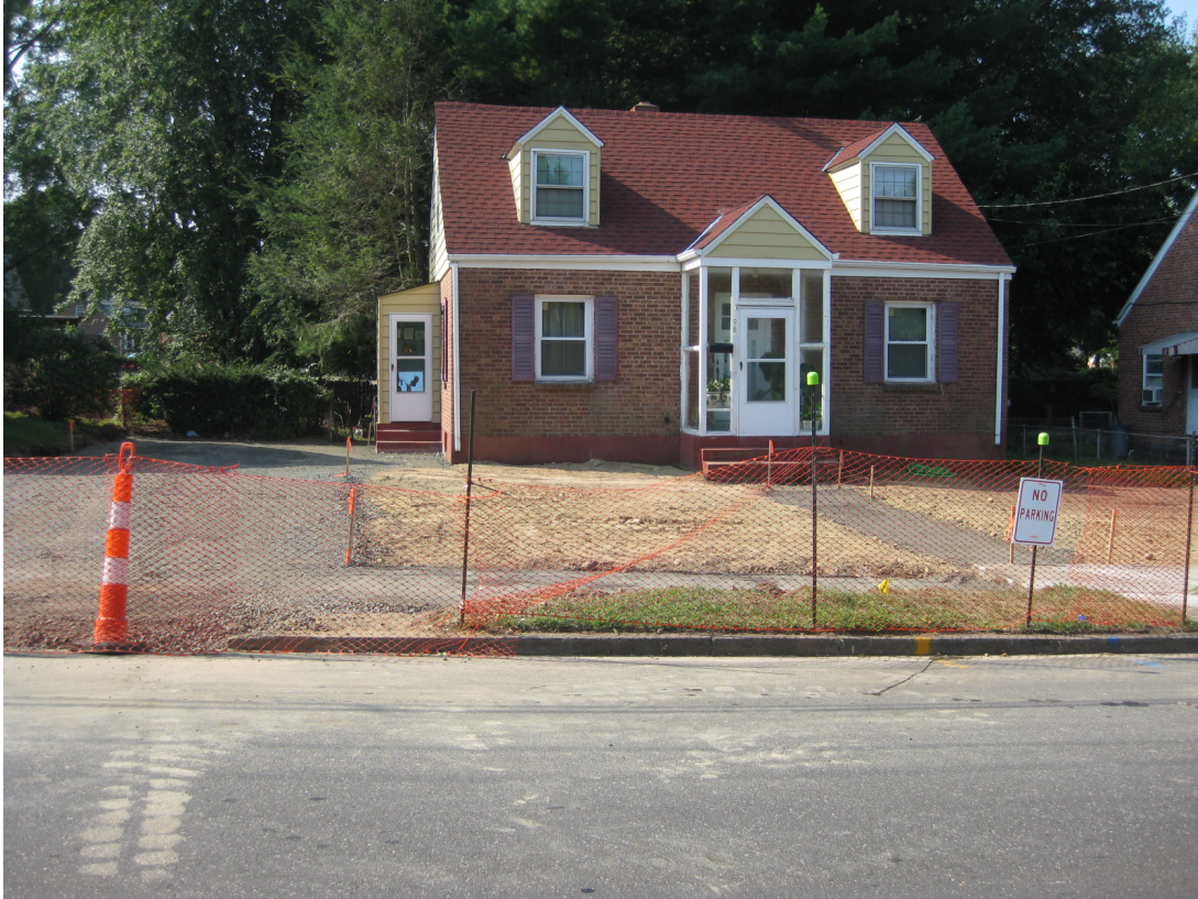
View looking south across Morse Street at property backfilled and prepped for restoration.