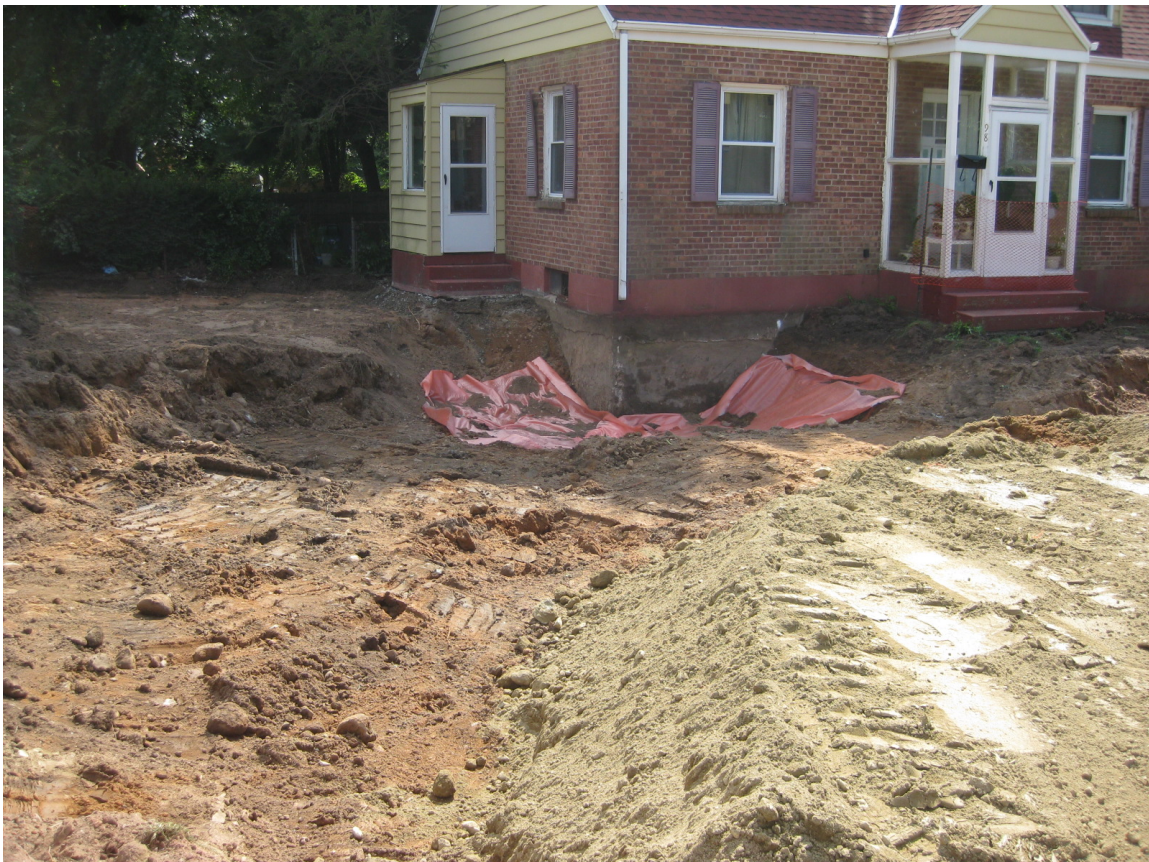
View looking southwest at at excavation in front yard following placement of marker barrier.