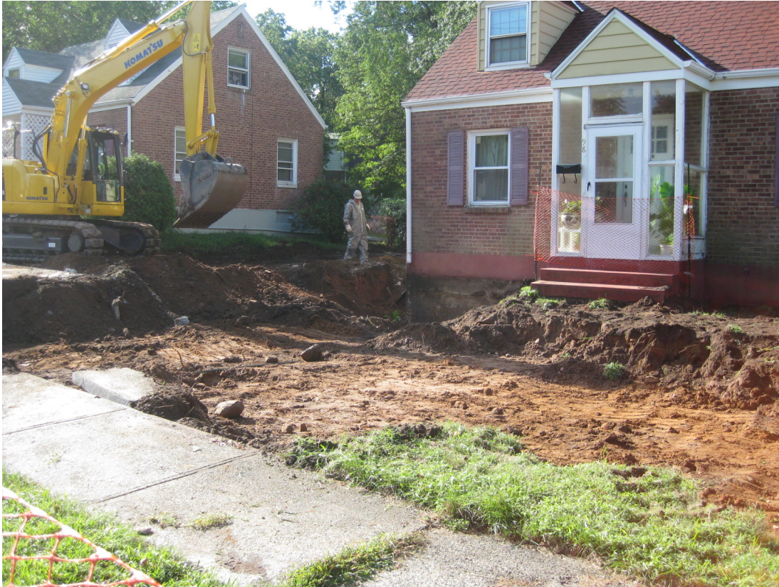
View looking southeast at excavation in front yard.