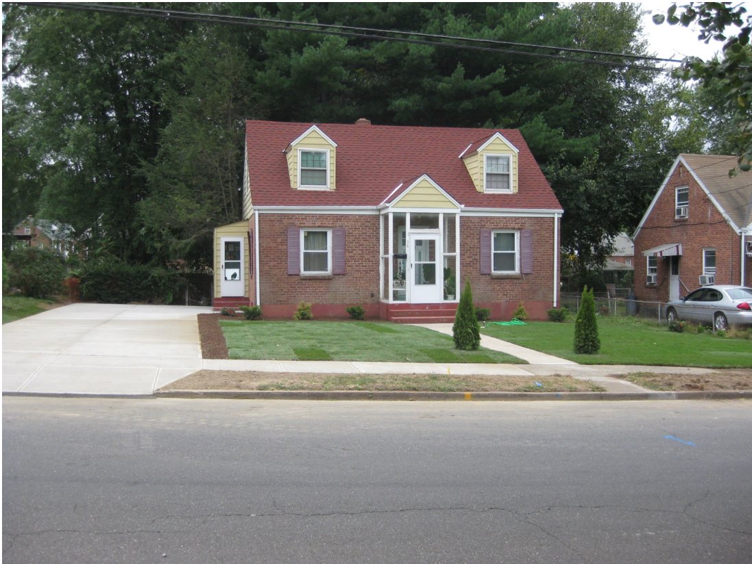
View looking south across Morse Street at restored property.